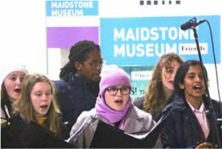
Christmas Concert, with the choir of Invicta Grammar School