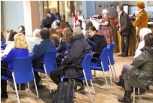
MMF Youth Ambassadors host a Reception for Friends in Maidstone Museum