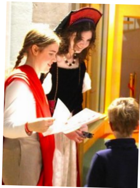
MMF Youth Ambassadors in Tudor dress welcome a young Friend to a reception in Maidstone Museum.

At the Year 7 Information Evening, families were told about the wonderful link that MMF provides between the museum and the school and invited to become members.